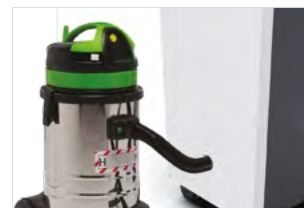
DCS-500 COMPLETE DUST COLLECTION SYSTEM to provide dust free padding mats.