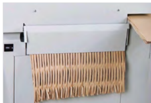
ADJUSTABLE CUSHIONING VOLUME OF HARD CARTON