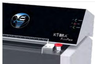
REMARKABLE TOUCH SCREEN PANEL