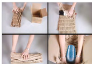
FILLING MATERIAL FROM CORRUGATED CARDBOARD for safe deliveries of any product.